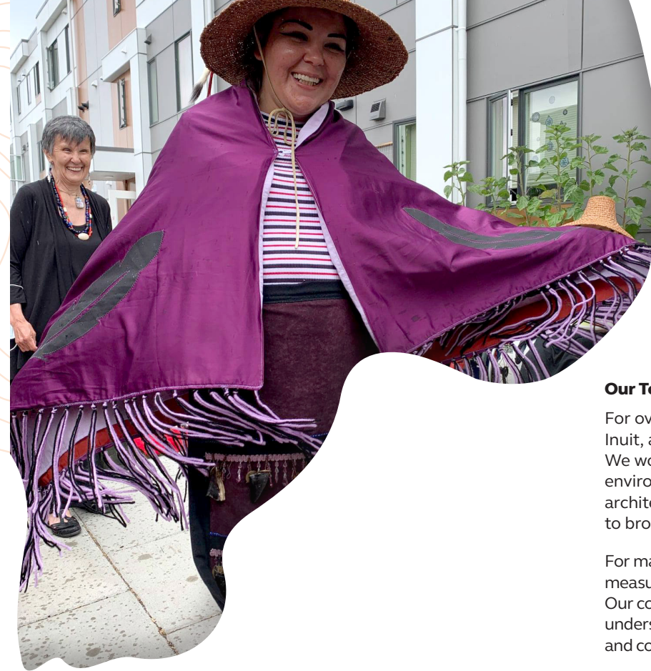
Source: Spaken House, Victoria, BC Photo courtesy of Aboriginal Coalition to End Homelessness